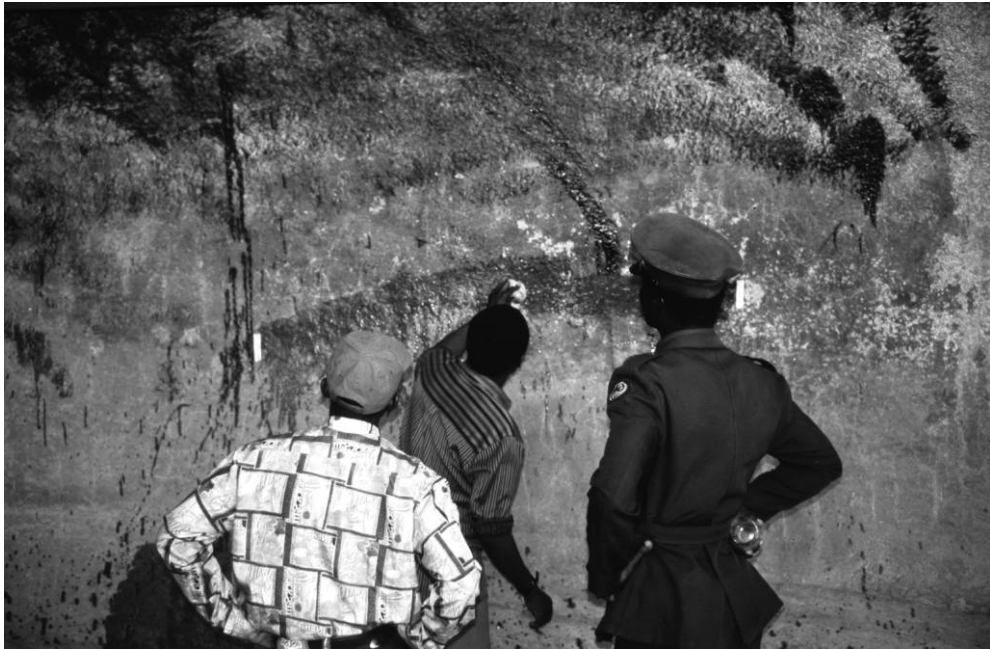
Figure 3. Vandalized rock art panel at Domboshava.