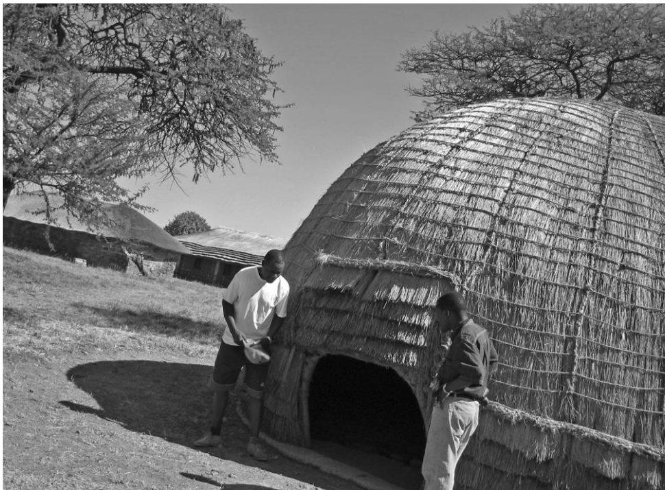
Figure 6. The reconstructed hut at Old Bulawayo facing in the "wrong" direction.

The above case studies from various parts of the world have shown that archaeologists are now genuinely taking local community sentiments and views into consideration. The end result of community archaeology has not, however, been without its problems, and this invites a deeper evaluation of the whole concept. Our review of the projects in southern Africa has shown that most of the problems are caused by archaeologists' tendency to treat local communities as passive agents. This has created conflicts at Domboshava, where the local community is calling for 50% of the revenue from the site and the power to authorize certain activities for its benefit. The NMMZ, considering this extreme, argues that it is an organization set up under the law and the communities should respect it. In a polemical defense of their position at a stakeholder meeting, local community members articulated that the law was made by parliament and the NMMZ should tell that parliament that the people no longer deemed the law