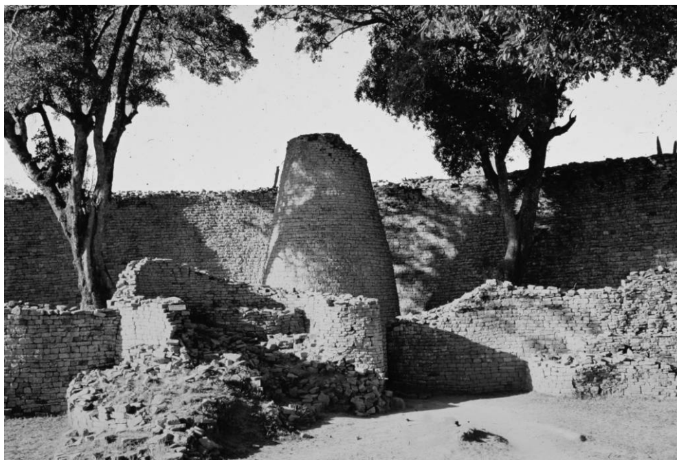
Figure 4. The interior of the Great Enclosure, Great Zimbabwe.

Zimbabwe remains the lifeblood of both the NMMZ and the local communities.