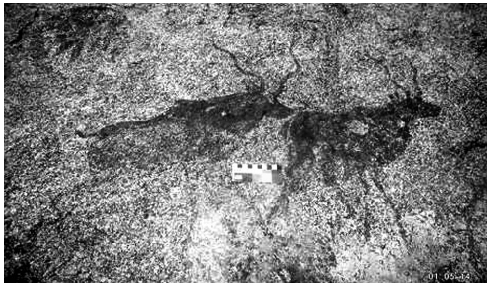
Figure 2. Rock art at Domboshava before vandalism.

tated and confrontational, committing several acts of vandalism in protest of their exclusion. These acts included burning down the curio shop and splashing oil paint on the most impressive rock paintings at the site (fig. 3). What must have been an eye-opener for the authorities was that it was only the contested site of Domboshava that was vandalized; other rock art sites in the region were left untouched. Thus, from the local communities' point of view, the message was clear—if they could not benefit from the site spiritually and economically, then archaeologists and the NMMZ would not benefit from it either.