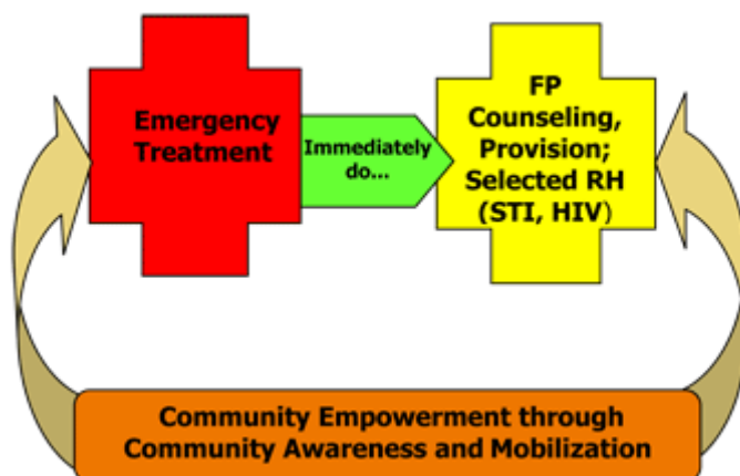
Figure 1: The USAID's Post abortion Care Model (2007)