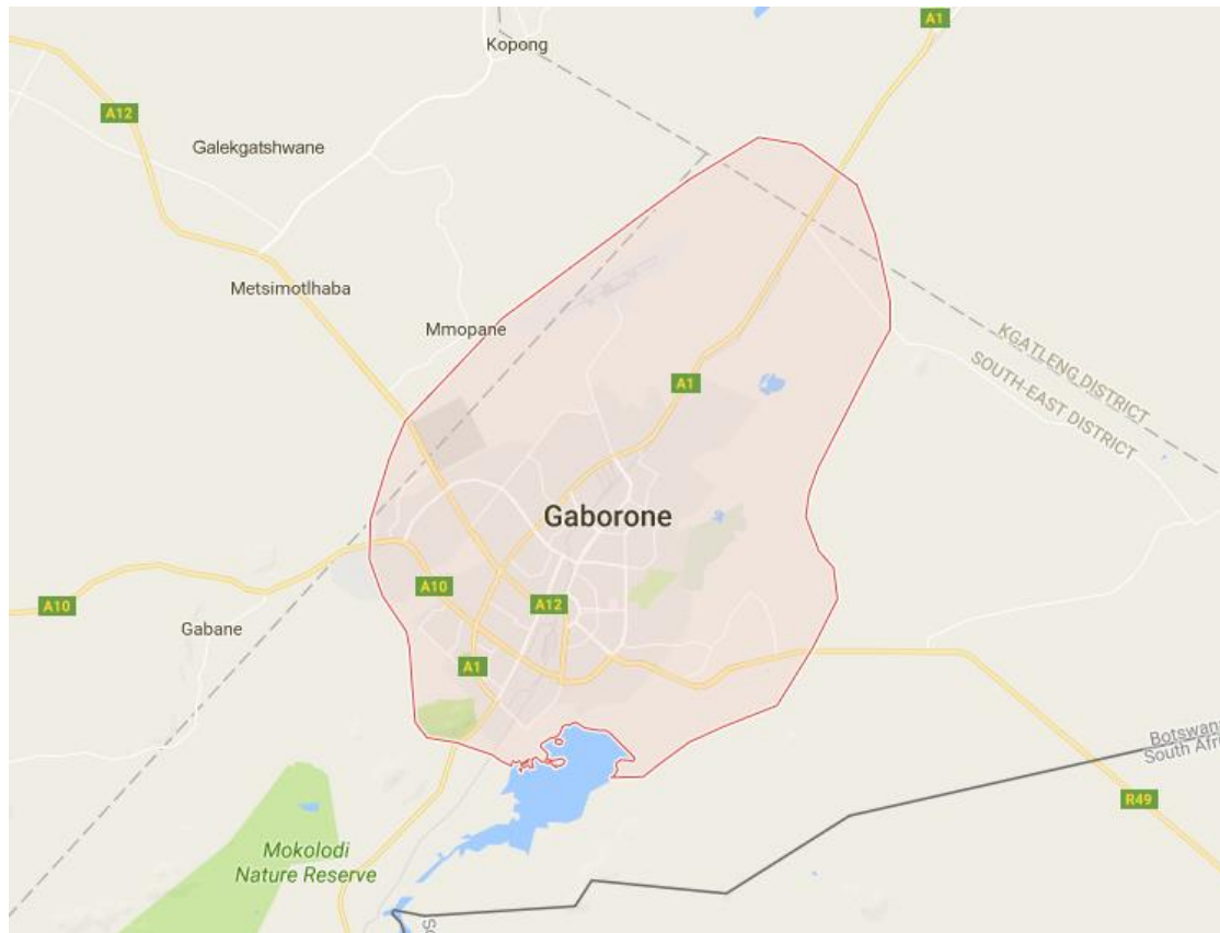
Figure 3.1: Study location, Gaborone Map: Adopted from Google Maps