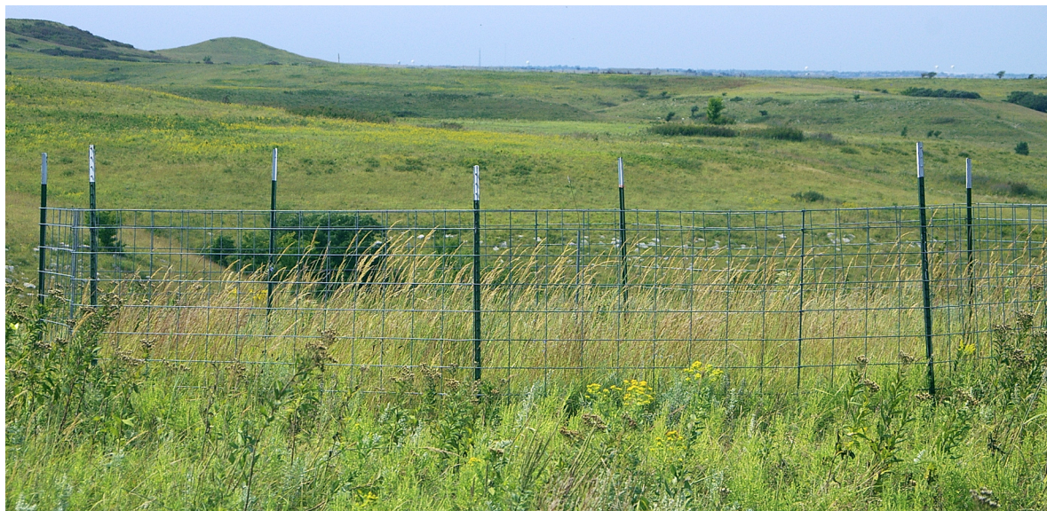
PLATE 1. Enclosure located at Konza Prairie, Kansas, USA, in annually burned grassland. The vegetation difference inside and outside the enclosure is evident with the tall dominant C 4 grass, Andropogon gerardii , flowering inside the enclosure and higher forb cover outside.

alterations in fire regime are lacking, particularly in savanna grasslands that differ in large-herbivore assemblages. Yet, such studies are critical for gaining a more general understanding of the global-scale impacts of modified disturbance regimes (Knapp et al. 2004).